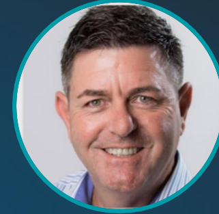
Warwick Grey Entek. Ltd, NZ C Emerging Tech