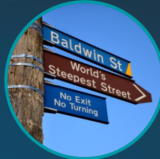
TBA NZ ?