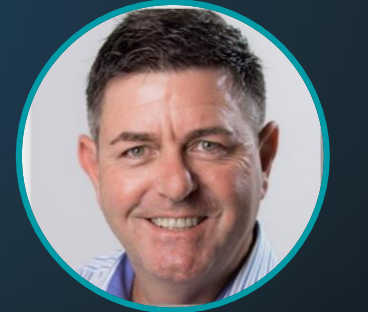
Warwick Grey Entek. Ltd, NZ C Emerging Tech